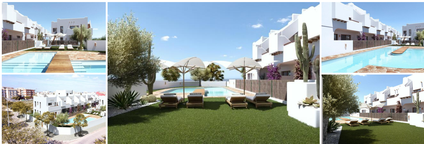
Exclusive New Build Bungalows in Pilar de la Horadada - Privileged Location