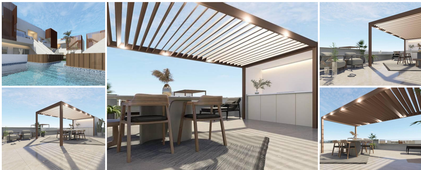
New Build Bungalows with Comunal Pool in Pilar de la Horadada – Costa Blanca South

Modern Residences Close to the Beach and Town Centre