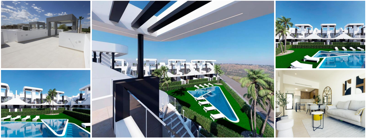
New Build Residential Complex in San Fulgencio