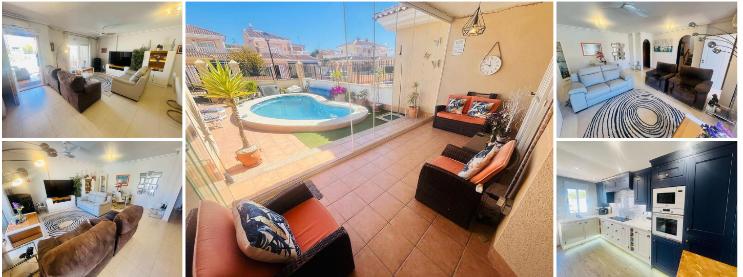
Stunning Terraced Villa with Private Heated Pool & Garage in Lomas Del Rame, Los Alcázares

This beautifully presented terraced villa, located in the tranquil area of Lomas Del Rame, offers the perfect blend of comfort, style, and outdoor living. On the ground floor, you'll find a spacious lounge and dining area, complete with a cozy pellet burner and glass sliding glass doors that open onto a glazed terrace—ideal for year-round relaxation while enjoying views of the private 6m x 3m heated pool. The separate 'Laura Ashley' designer kitchen is both stylish and functional, offering direct access to the private walled rear garden, a perfect spot for alfresco dining. Two generously sized double bedrooms and a modern bathroom complete this level.