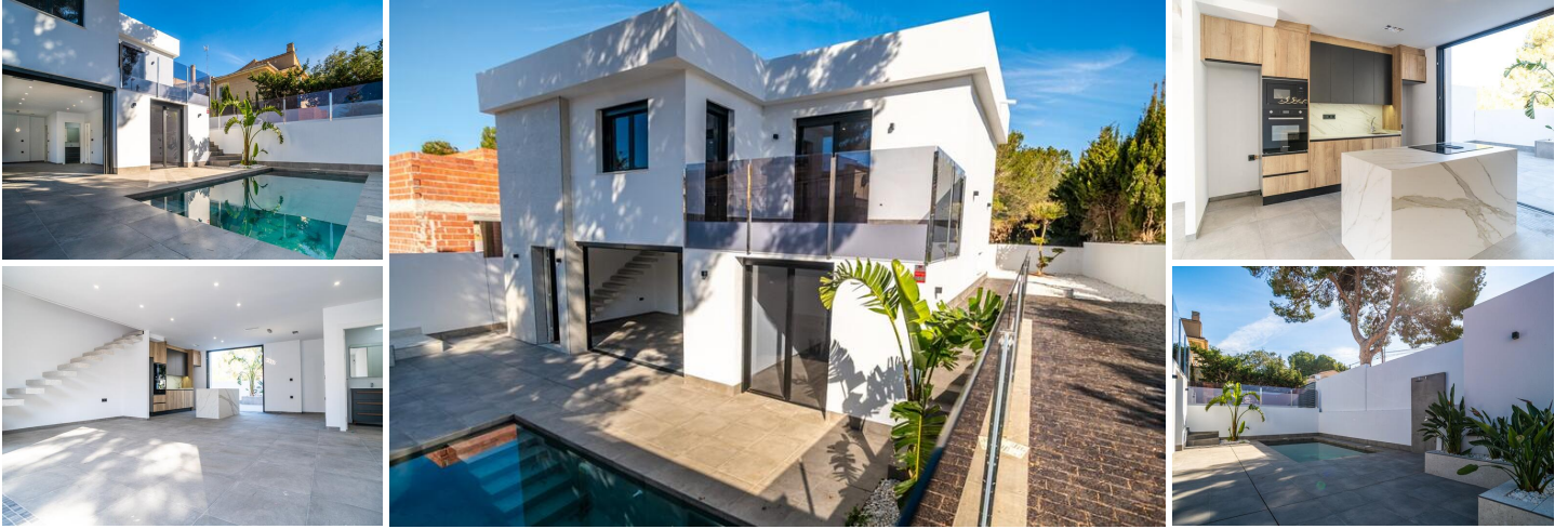
Luxury Detached Villa with Private Pool and Ample Parking

Discover this beautiful south facing detached villa, an oasis of peace and luxury, perfectly designed for ultimate living comfort. With a generous plot, a private pool and private parking spaces, this property offers everything you are looking for in an exclusive residence.