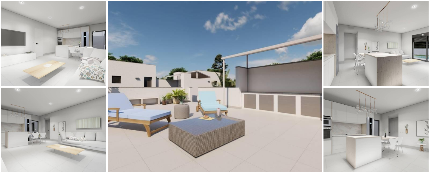
Semi-detached and Semi-detached Villas in Roldán, Murcia, Spain