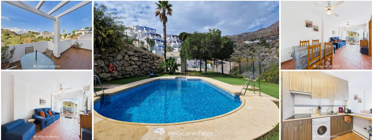
3-Bed Apartment with Sierra Cabrera Views & Pool – Mojácar Playa, Almeria, Andalusia.

This spacious three-bedroom, first-floor corner apartment in a prime elevated position on Mojácar Playa offers stunning views of the Sierra Cabrera mountains. Located 750m (approximately a 12-minute walk) from the beach, the property is set on an incline—making the walk down to the sea easy, with an uphill return. With lift access, a large terrace, and a community swimming pool, this apartment provides a fantastic blend of comfort and convenience. An allocated parking bay and a private 18.4m 2 storeroom add to its practicality, making it an ideal choice for a holiday home or permanent residence.