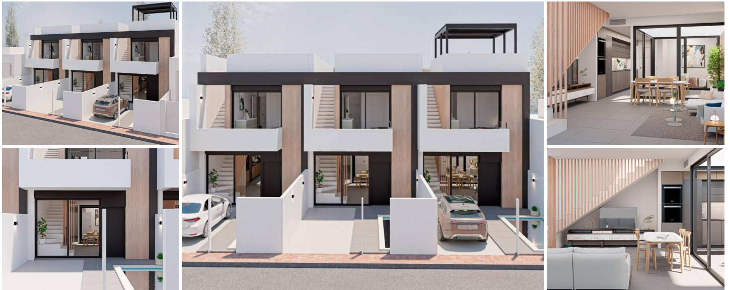
New Construction Townhouses in San Pedro del Pinatar