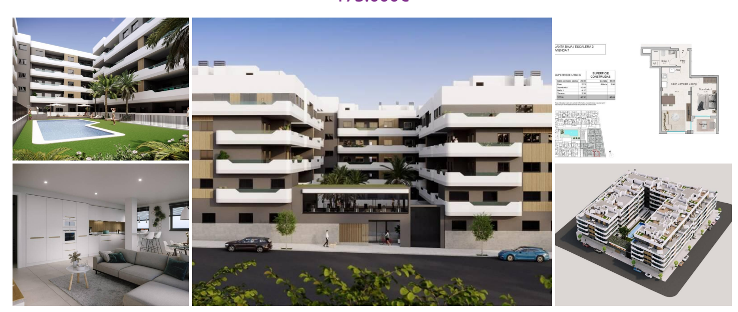
NEW BUILD RESIDENTIAL COMPLEX IN SANTA POLA

New Build modern gated residential complex consisting of 1, 2 and 3 bedroom apartments and penthouses with 2 complete bathrooms. The complex consists of 4 staircases of flats with spacious landscaped communal areas, including swimming pool, relaxation area and gymnasium.