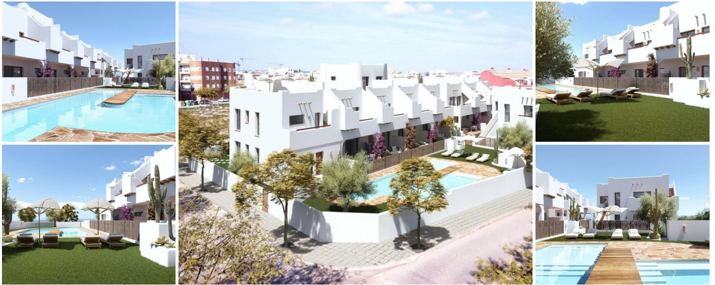
Exclusive New Build Bungalows in Pilar de la Horadada - Privileged Location

A Unique Residential to Enjoy the Mediterranean