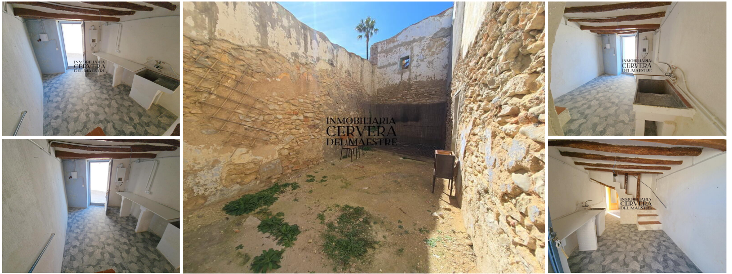
Town House of 82m2 in Calig With Annex / Court Yard.

Renovated house of 82m2 distributed over three floors located on the outskirts of the historical town of Calig, and with an annexed plot of 34m2.