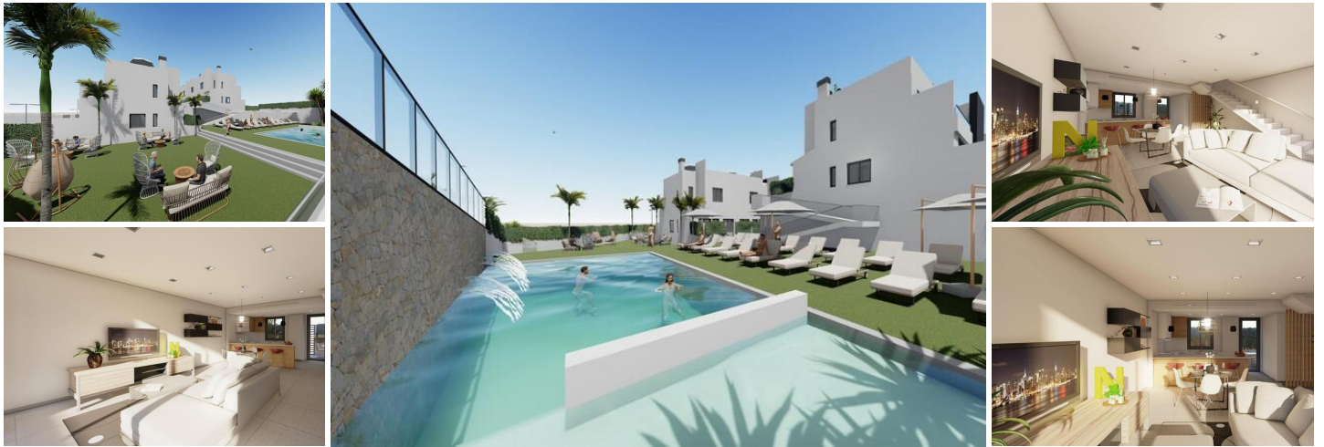
New Build Townhouses for Sale in Cox – 44 Modern Homes with Great Amenities

Discover a new residential development of 44 modern townhouses in Cox, Alicante. These homes are available in 2- and 3-bedroom layouts, each featuring a private solarium, terraces, patios, and private parking. The community offers access to shared areas, including a communal swimming pool, creating an ideal environment for relaxation.