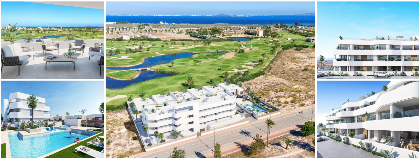
New Build Residential complex in Los Alcazares

Los Alcázares is an idyllic location for those looking to invest in a new residential property on the Costa Cálida. Just 25 minutes from Murcia Airport and approximately 55 minutes from Alicante Airport, this area is conveniently connected by highway to major cities like Cartagena, Murcia, and Alicante, as well as to other beautiful beaches along the Costa Cálida and Costa Blanca.