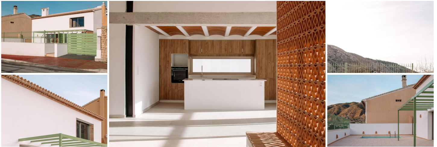
NEW BUILD VILLA IN ORXETA

New Build a single-family house in Orxeta, a peacefully town in a beautiful and fertile valley on the banks of the Sella river, and near to the coast.