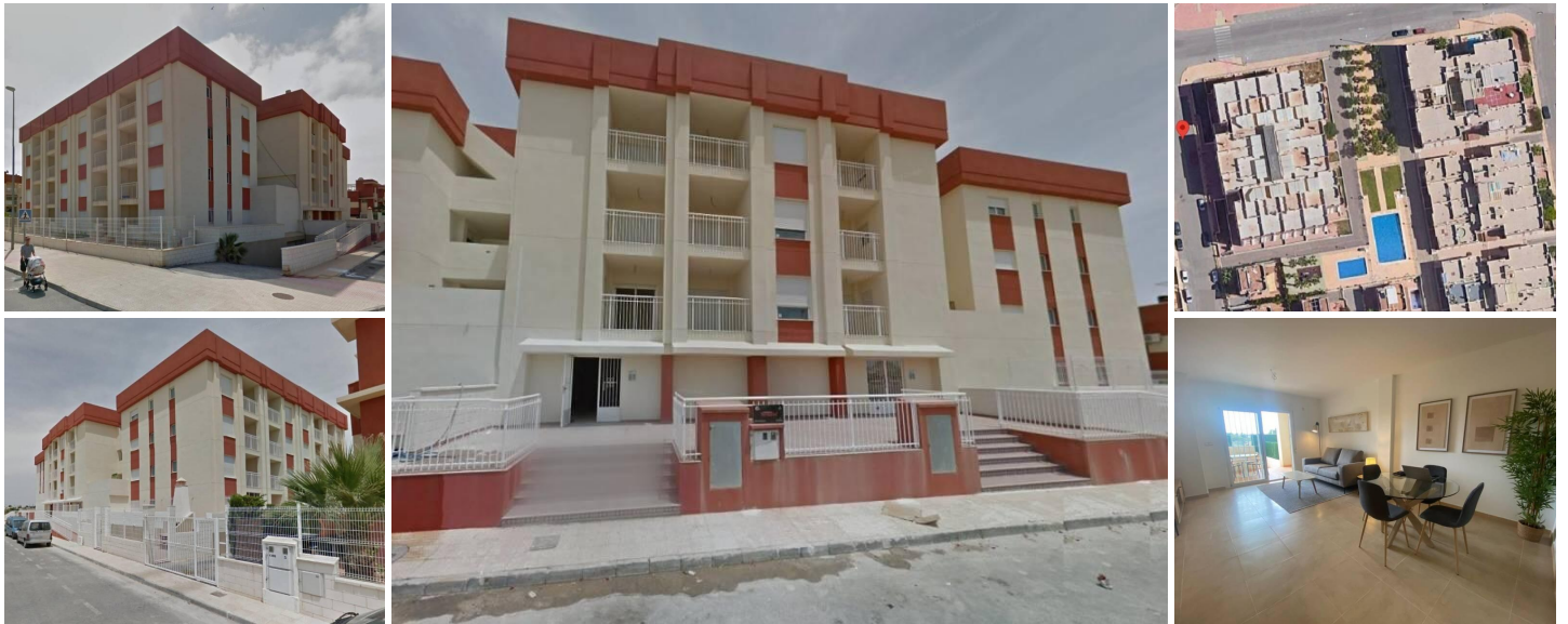
Regenerated Residential Complex in Lomas de Cabo Roig – Renovated Apartments