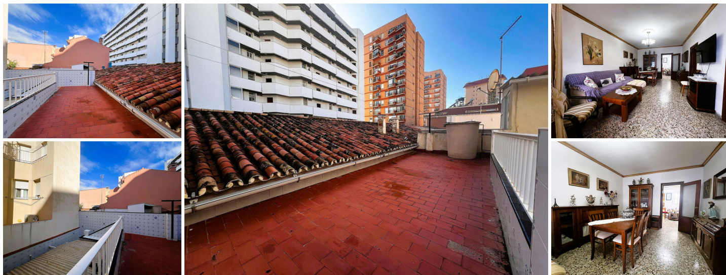
Central House for Sale in the Second Line of Fuengirola's Seafront Promenade

This property offers a total of 115 m 2 on one floor, with a solarium and storage room. The current layout includes a spacious living-dining room, 3 bedrooms, an independent kitchen, a large bathroom, storage room, patio, covered porch at the entrance, and a top terrace.