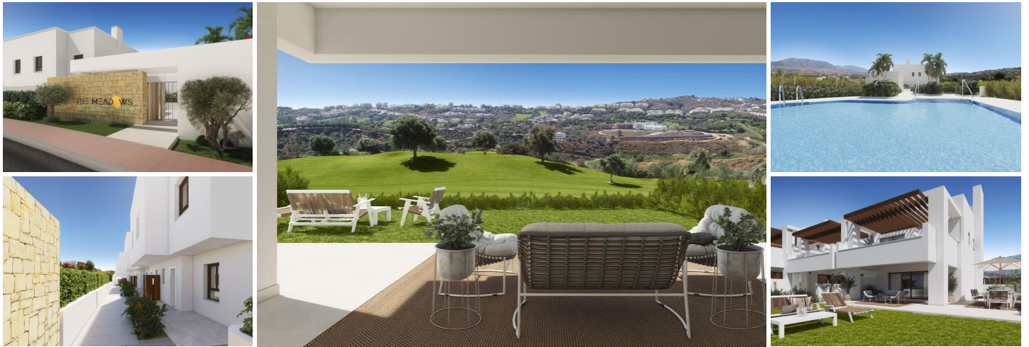
THE MEADOWS, BRAND NEW TOWNHOUSES FOR SALE AT LA CALA GOLF RESORT, MIJAS, COSTA DEL SOL

The Meadows is a new project in La Cala Resort formed by 26 spacious townhouses in front line golf position with panoramic views of the resort and Mijas valley. South-west orientation. The homes are distributed over 3 levels in a private gated community with communal pool and gardens.