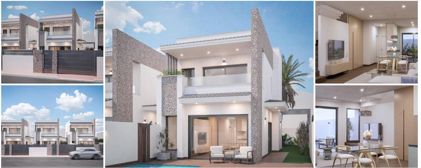
Luxury Villas in San Pedro del Pinatar - Modern Living in a Prime Location