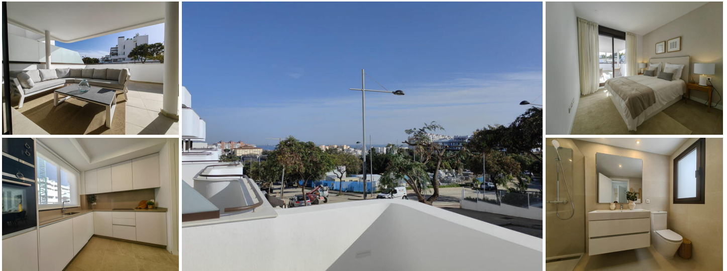
Brand-New Luxury 4-Bedroom Apartment in South Place, Las Mesas, Estepona

Discover modern elegance and luxury living in this stunning 4-bedroom, 2.5-bathroom apartment, located in the highly sought-after South Place, Las Mesas area of Estepona. Boasting high-end finishes, excellent building materials, and a sleek contemporary design, this brand-new home offers the perfect blend of sophistication and comfort.