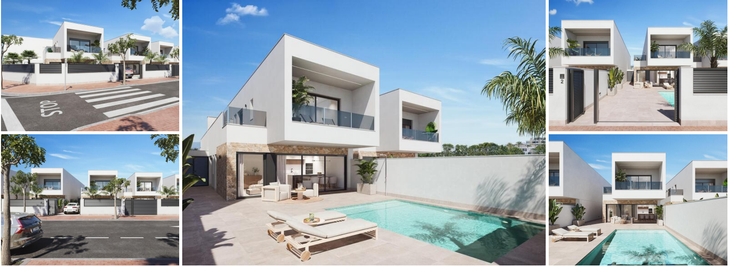
Modern New Build Villas in San Pedro del Pinatar with Private Pool