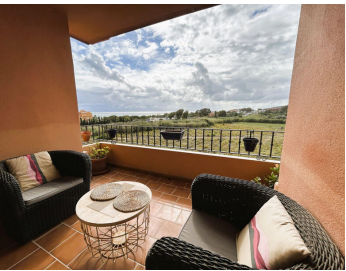
This is a charming and bright 2 bedroom Los Hidalgos Golf apartment with sea views, ideally situated on an established complex near to La Duquesa.

Los Hidalgos Golf is a secure gated complex with beautifully maintained gardens and large pool area. It is only a short walk to the blue flag beach, a selection of supermarkets and the lively marina and golf of La Duquesa. Nearby are the traditional villages of Castillo and Sabinillas, all with a fabulous selection of shops, tapas bars and restaurants. Excellent access to Gibraltar and Marbella (30 mins) and Malaga Airport (under 1 hour).