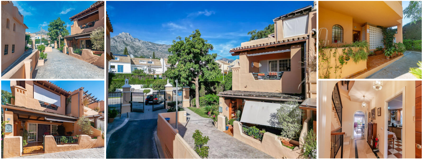
Corner Townhouse in Nagüeles, Marbella