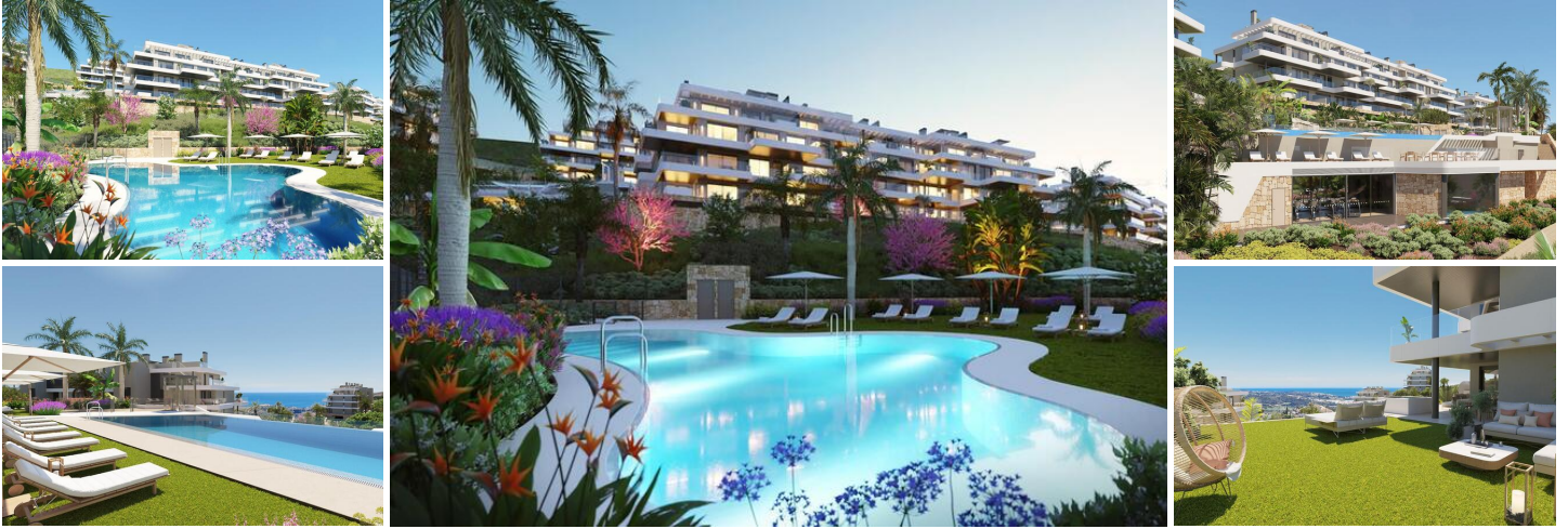
NEW BUILD RESIDENTIAL COMPLEX IN CALANOVA GOLF, MIJAS

This luxury apartment complex offers a lifestyle that dreams are made of – a sumptuous residence featuring huge terraces with unbeatable views, a top-class golf course less than three minutes' walk away and amenities that befit a five-star resort