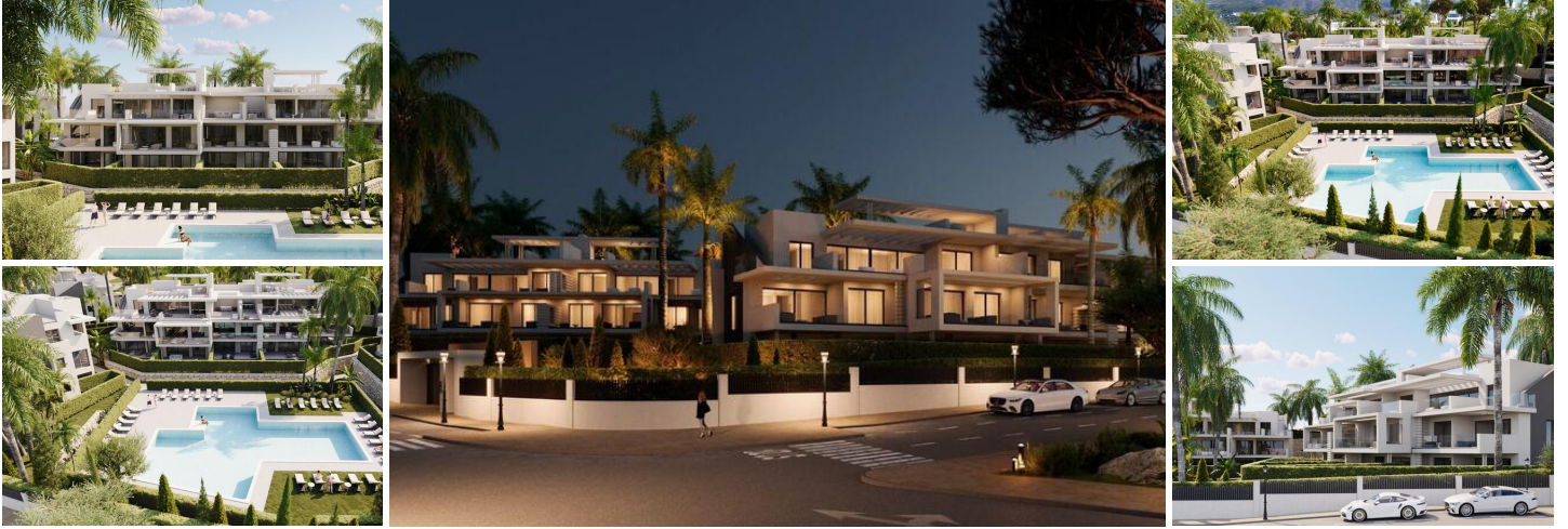
Modern Living in Estepona: Spacious Apartments with Sunny Terraces