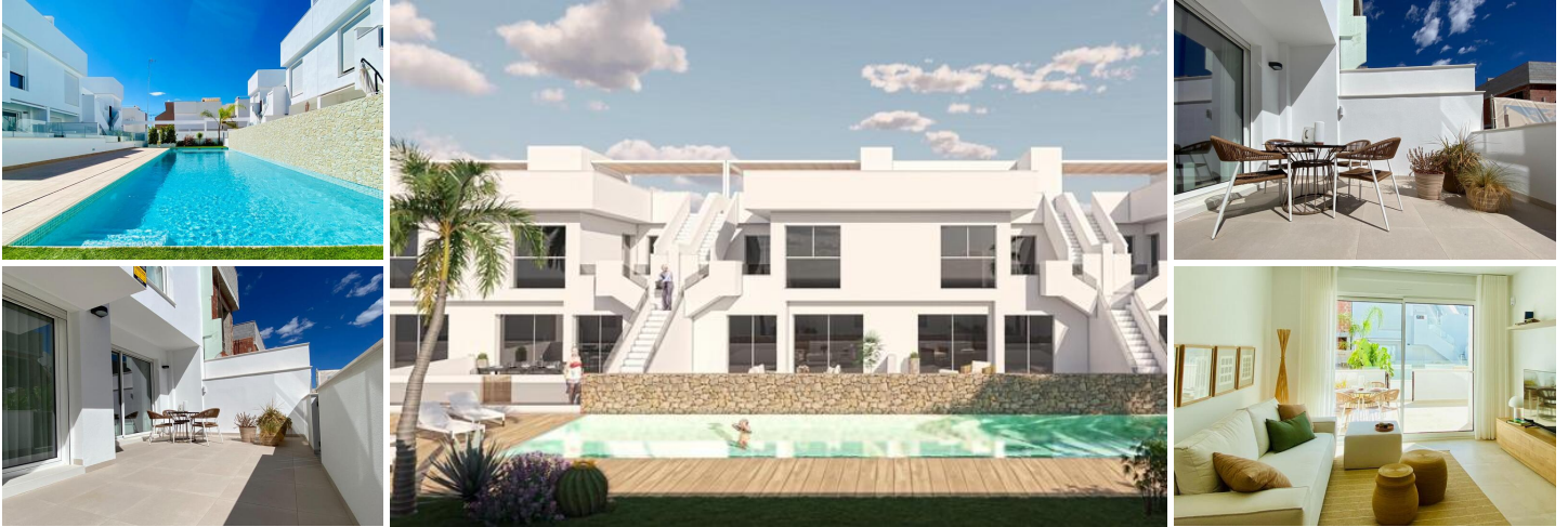
New Build Bungalow Residential Complex in Pilar de la Horadada