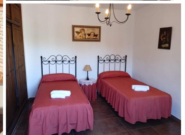
Cortijo In Torrox Costa For Long Term Rental

A very well presented cortijo in a quiet location with good access close to Torrox Costa. The accommodation comprises of two double bedrooms and one bathroom, with a lounge and dining area together with a fully fitted kitchen. From the lounge there are doors out to the covered terrace with table and chairs and access to the private swimming pool and BBQ area. It has access to the private parking area.