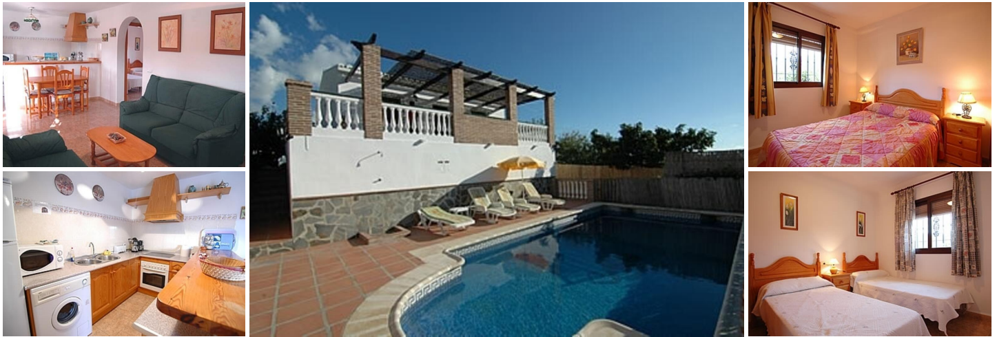
CORTIJO FOR WINTER RENTAL SITUATED IN THE FRIGILIANA COUNTRYSIDE

A Two Bedroom Property located of the Nerja-Frigiliana Road. Good access from the main road. Kitchen-Lounge-Diner, full bathroom. Private pool and terraces. wifi available for 30 euros per month.