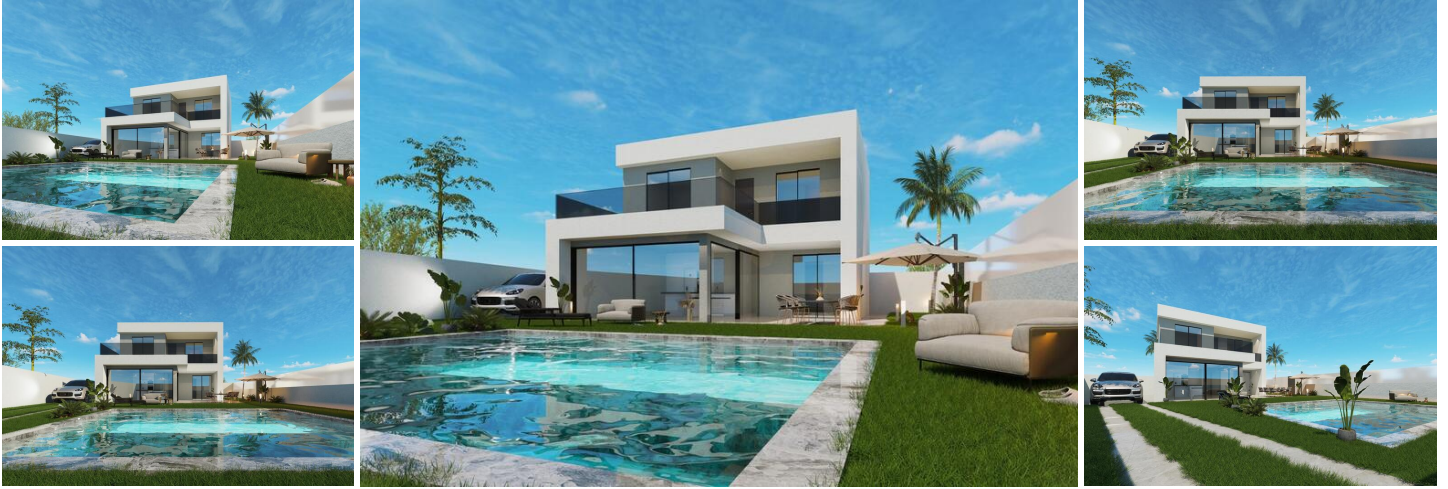
NEW BUILD VILLA IN SAN PEDRO DEL PINATAR

New Build beautiful two level villa have been thoughtfully designed to provide the perfect individual private contemporary living space, featuring double full glass sliding doors that open directly on to a large terrace with private swimming pool enclosed gardens with off road parking. "SUN ALL DAY" with first floor terraced area to enjoy the sun all day long ... Located in a centralised, established residential area just 10 minutes walk to the beaches in San Pedro del Pinatar.