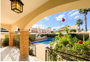
Exclusive New Construction Villas in San Javier, Murcia