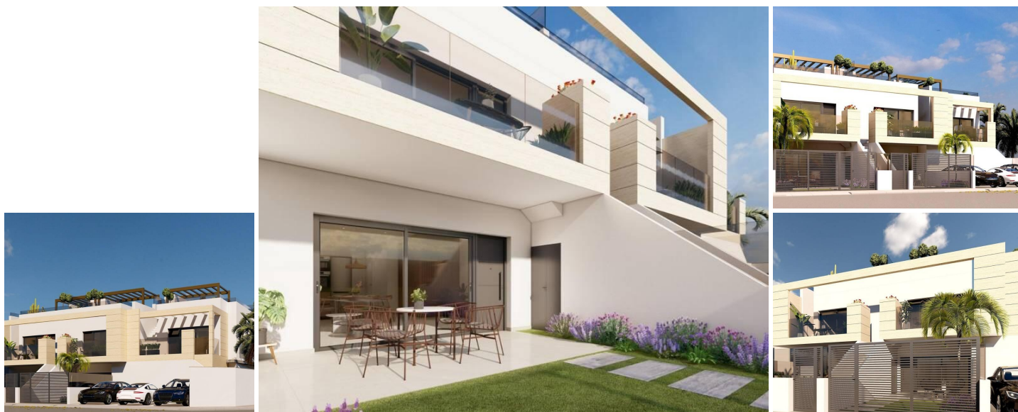
New Build Bungalows in Lo Pagán: Modern Living Near the Beach

Prime Location in Lo Pagán, San Pedro del Pinatar