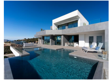
Modern New-Build Villas in Benijófar with Private Pools