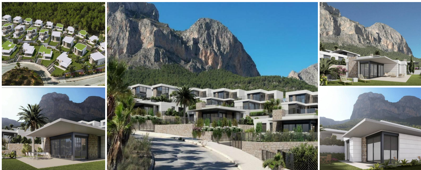
New Construction Villas in Polop, Alicante