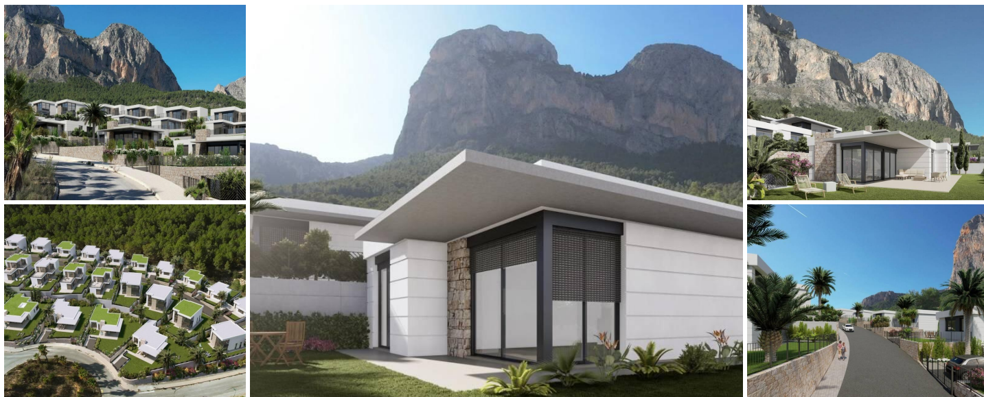
New Construction Villas in Polop, Alicante