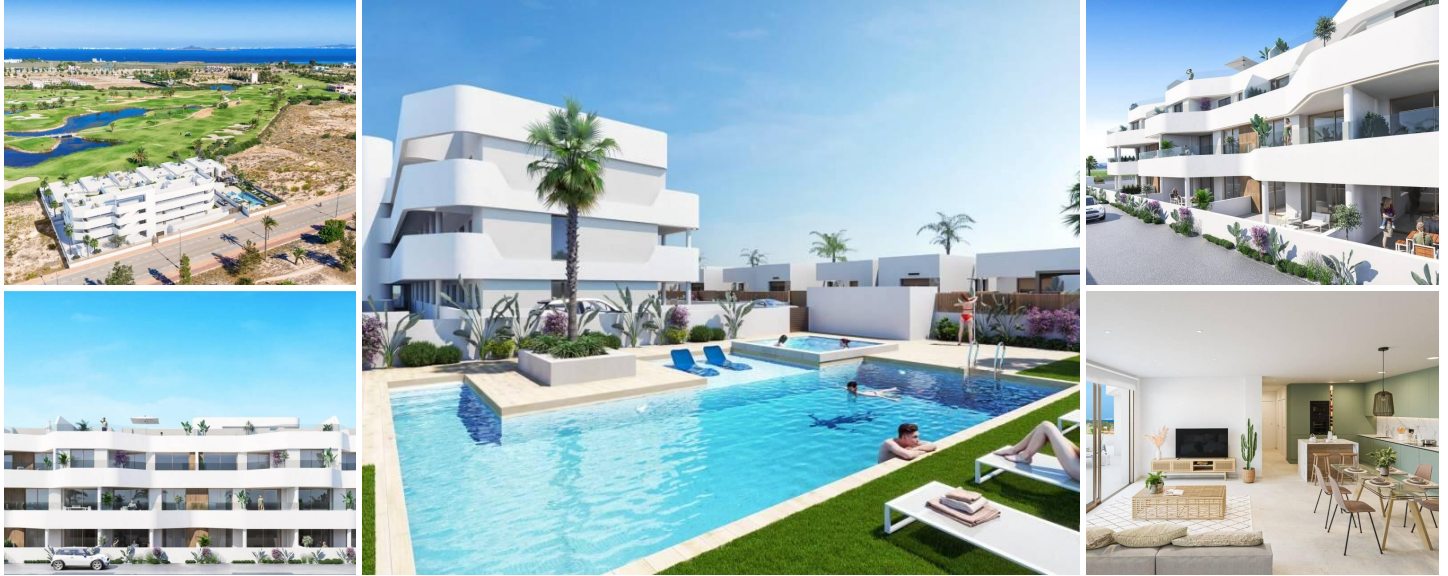
New Build Residential complex in Los Alcazares

Los Alcázares is an idyllic location for those looking to invest in a new residential property on the Costa Cálida. Just 25 minutes from Murcia Airport and approximately 55 minutes from Alicante Airport, this area is conveniently connected by highway to major cities like Cartagena, Murcia, and Alicante, as well as to other beautiful beaches along the Costa Cálida and Costa Blanca.