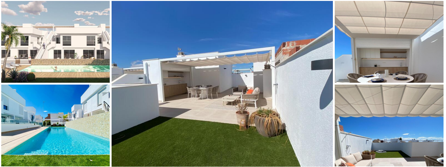
New Build Bungalow Residential Complex in Pilar de la Horadada