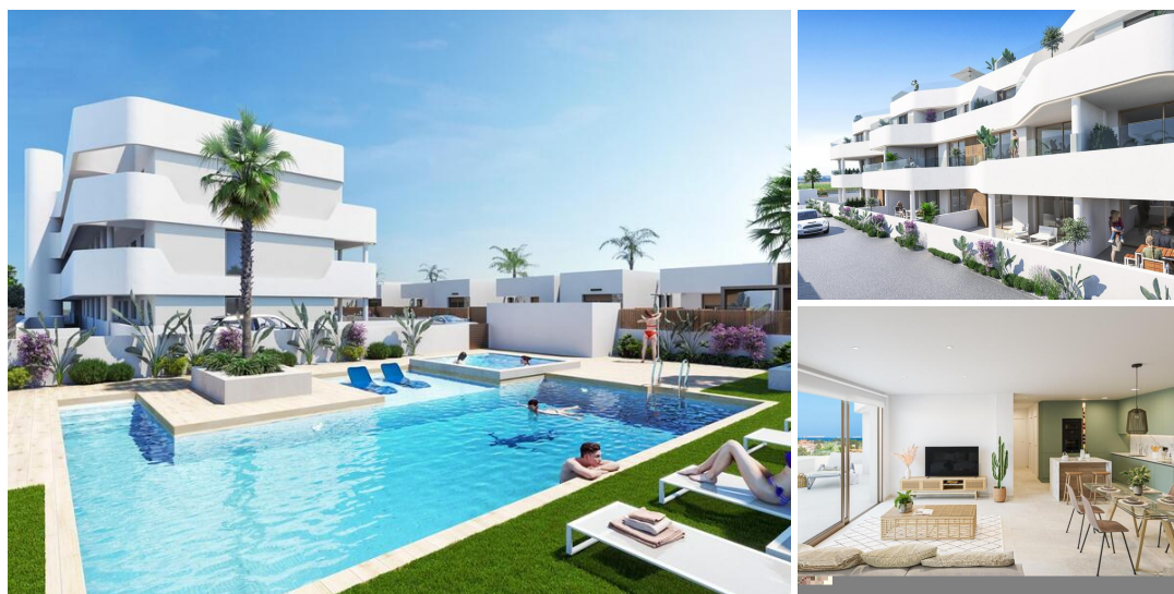
New Build Residential complex in Los Alcazares

Los Alcázares is an idyllic location for those looking to invest in a new residential property on the Costa Cálida. Just 25 minutes from Murcia Airport and approximately 55 minutes from Alicante Airport, this area is conveniently connected by highway to major cities like Cartagena, Murcia, and Alicante, as well as to other beautiful beaches along the Costa Cálida and Costa Blanca.