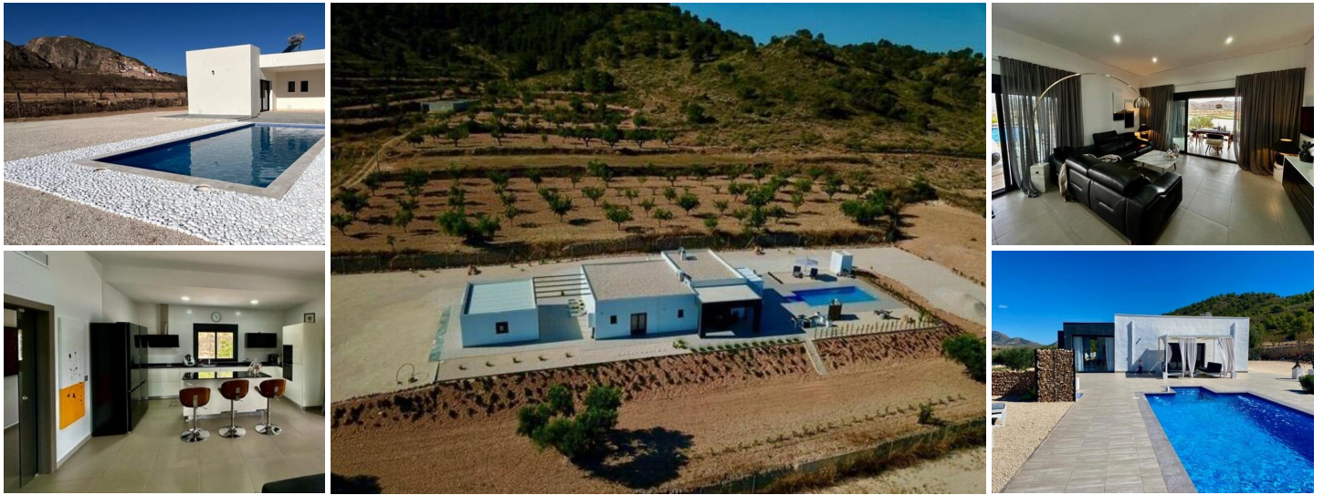
NEW BUILD VILLA IN ALBANILLA, MURCIA

New Build villa on a large plot in the municipality of Abanilla, province of Murcia.