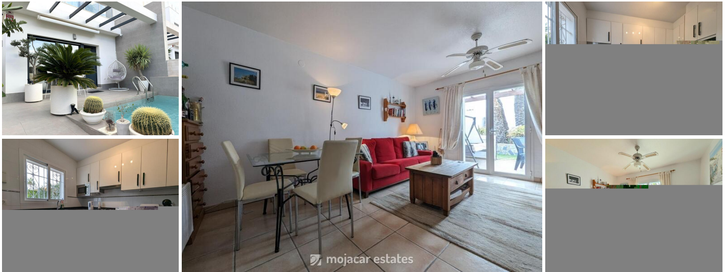
Las Palmeras Suzy

Nice townhouse located in Mojacar Playa in the quiet residential area known as El Palmeral, a very short walk ( 30 metres) to beach and amenities. The nearest beach is Playa del Descargador. Also, a short walk to the commercial center.