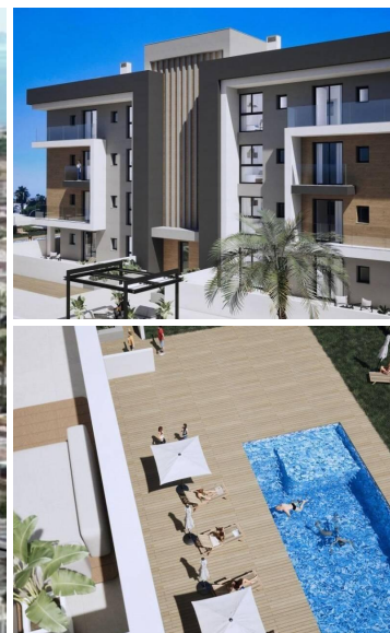
Tourist Apartments with Rental License in Los Narejos, Los Alcázares