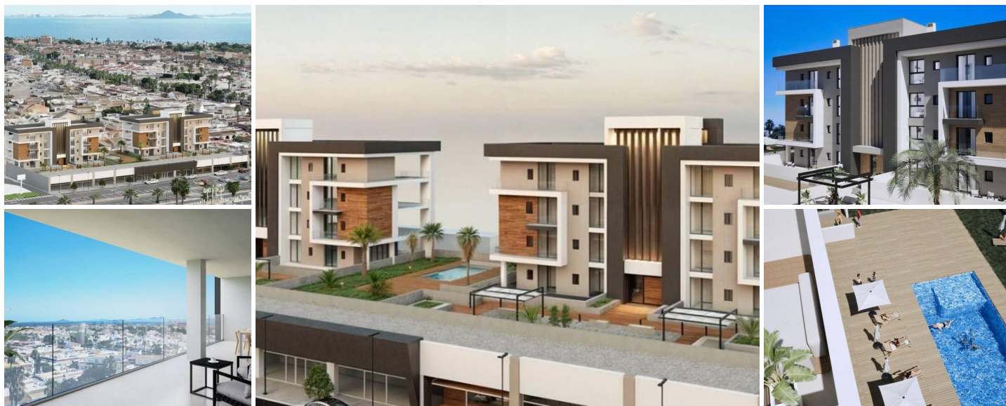
Tourist Apartments with Rental License in Los Narejos, Los Alcázares