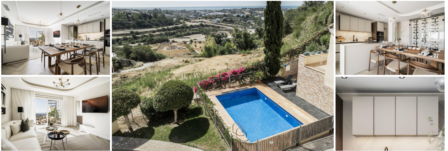
LOS ALMENDROS, BENAHAIVIS ... 3 Bedroom, 3 Bathroom Penthouse

FREE Notary fees exclusively when you purchase a new property with MarBanus Estates