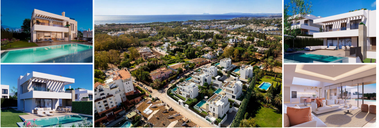
NEW CONTEMPORARY VILLA - Atalaya (New Golden Mile)

This new development of luxury south facing detached villas is in a prime location of Estepona, in walking distance to Atalaya Golf Club and within a short drive to all amenities and the beach, which can also be reached by a 25 min walk. Puerto Banús is just less than 10 minutes away so that you can enjoy its marina, the exclusive shops on the Golden Mile and, the top-end restaurants with their Michelin stars.