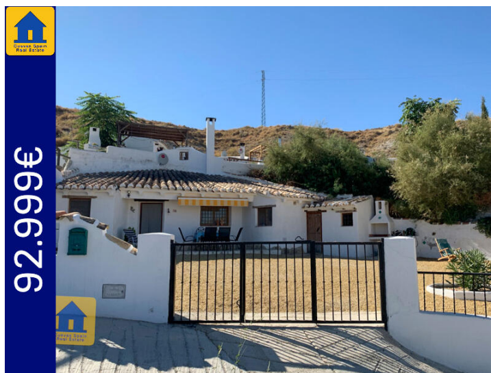
Cave Mabs in Galera

This is one of the beautiful caves found in the village of Galera. This property is located in the heights of Galera and has stunning views over the mountain ranges. It has an expansive, gated patio with potential for a garden, jacuzzi or above ground pool. From the patio, you enter the spacious living/dining room with high ceilings and lots of light. To the right is a lovely, fully fitted kitchen. Straight ahead upon entering is a hall area leading to two bedrooms. To the left is a bathroom and hallway leading to the master bedroom with ensuite bathroom. Outside, to the right of the cave, is a utility room with the washing machine and storage space. This cave is impeccably designed and maintained with great taste and care. The property can be purchased fully furnished (negotiable) and is ready to move in. The village center with amenities, restaurants and tapas is a 10-15 min walk away.