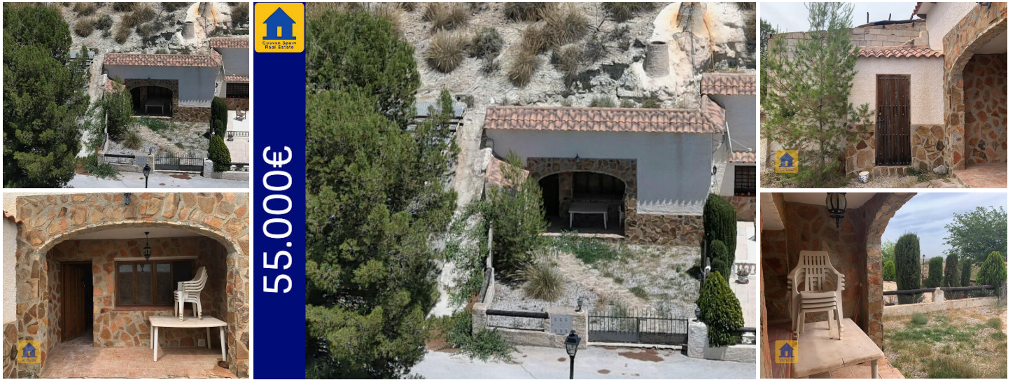
Cueva Peter in Los Carriones

Cueva Peter is a charming little cave house on the edge of the beautiful hamlet of Los Carriones. The cave has an open plan living room/dining room/kitchen, 2 double bedrooms and a bathroom. There is a delightful front patio and garden with views of the dramatic Badlands.