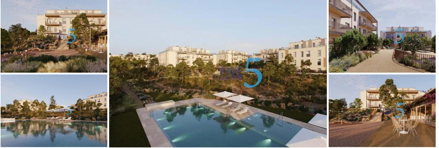
NEW BUILD RESIDENTIAL COMPLEX IN GODELLA, VALENCIA

New Build development with high quality is a constant and an ever-present objective, which is why we have thought of all the details of your new home.