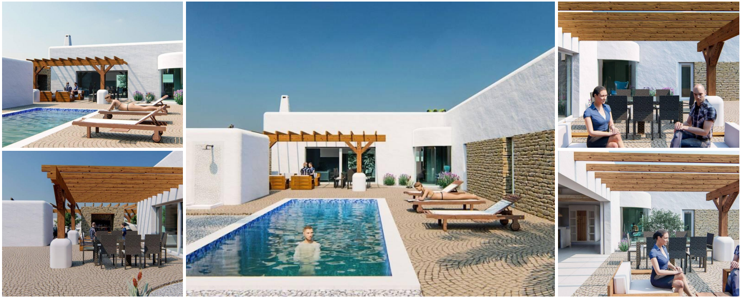
NEW BUILD IBIZA STYLE VILLAS IN ALFAZ DEL PI

Fantastic New Build Ibiza style villas in Alfaz del Pi, close to the El Arabi urbanization. Connected to the urban centre of Alfaz del Pi (shops, sports centre, schools) and a few minutes from El Albir with easy connection.