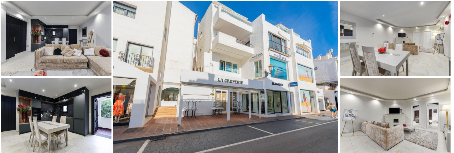
ALMA Apartment - Long Term Rental in Puerto Banus

On the 2nd line of the Port of Puerto Banus, we present to you a spacious apartment renovated with charm and taste. Ideally located (quiet part of the port) in the heart of the shops, 1 minute walk from the port and 3 minutes from the beach, it is perfect for people who love city life and the beach