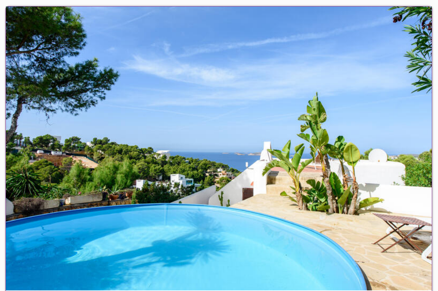
Lägenhet i Sant Josep de Sa Talaia (Cala Moli)