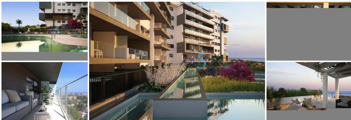
GROUND FLOOR FLAT IN LUXURY RESIDENTIAL COMPLEX NEXT TO THE SEA

Imagine a place where the sea and nature become the protagonists of an incredible story: yours. Imagine an environment where you can give free rein to your imagination and live a thousand adventures by land sea. Welcome to this new Residential in Campoamor, the home where you can live the life you have always dreamed of with the most beautiful horizon in the background: the Mediterranean.