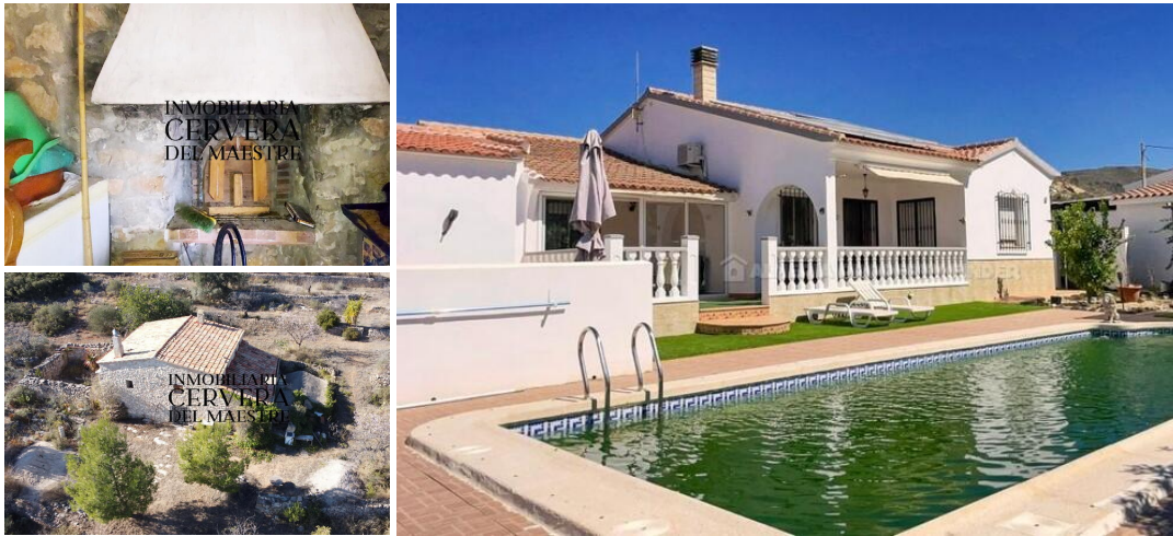
Villa Música - A villa in the Limaria area. (Resale)

A 180 m 2 , 3-bed villa with a separate 1-bed guest annex set on a 1080 m 2 plot with a pool just 5 mins from town.